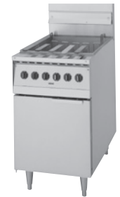
FBR18 Gas Rethermalizer

STANDARD ACCESSORIES: 6" legs, brush. See page 36 for optional accessories.