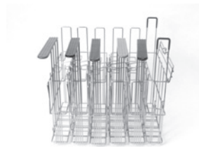
FBR18 Color-coded Baskets and Food Basket Holder Rack