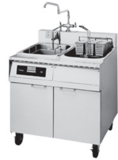
8SMS Electric Cooker and Rinse Tank Shown with optional casters