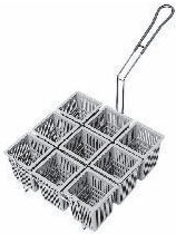
Portion Cup Rack Shown with Portion Cups