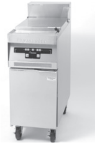
FE155 Electric Rethermalizer

STANDARD ACCESSORIES: 6" legs, brush. See page 36 for optional accessories.