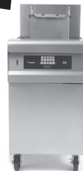
GPC Gas Pasta Cooker Shown with optional casters

STANDARD ACCESSORIES: legs, bulk pasta basket and option of portion cup rack with 24 portion cups or three round pasta baskets. See page 36 for optional accessories.