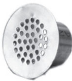
Rinse Tank Screen