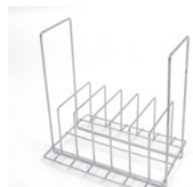
FGP Food Basket Holder Rack