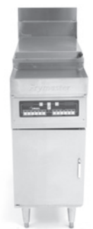
FGP55 Gas Rethermalizer

STANDARD ACCESSORIES: 6" legs, brush. See page 36 for optional accessories.