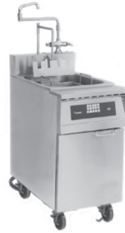
8BC Electric Cooker Shown with optional casters

STANDARD ACCESSORIES: legs, bulk pasta basket and option of portion cup rack with 24 portion cups or three round pasta baskets. See page 36 for optional accessories.