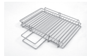
FGP Food Basket